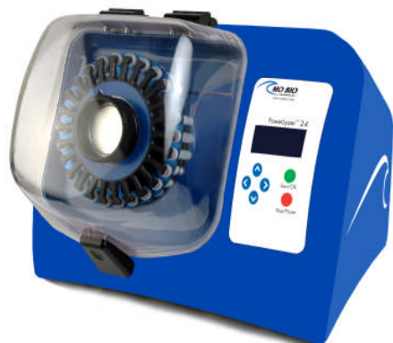
PowerLyzer ™ 24 Bench Top Bead-Based Homogenizer Catalog#13155 ( www.mobio.com/powerlyzer )