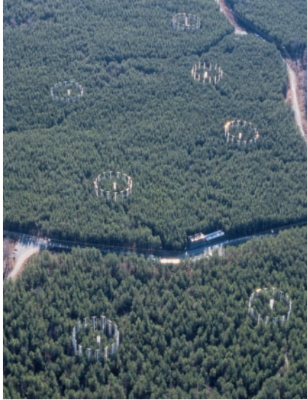
Fig. 1. Free-air CO 2 enrichment (FACE) rings in a pine plantation in North Carolina, USA. Each ring is 30 m in diameter and circumscribes about 100 trees. The distance from the single ring in the southwest (top right) to the two rings in the north (bottom) is ~500 m. The single ring in the background is a prototype. There are six experimental rings; three rings receive ambient air and three receive ambient plus 200 μl liter -1 CO 2 (photo: Will Owens).